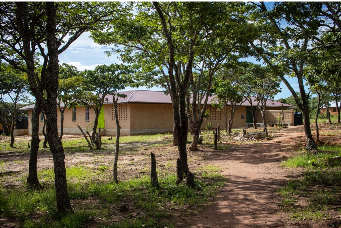
The buildings are built in Interlocking Stabilized Soil Blocks that are easily produced by the village using local clay.

The broader impact of Ukumbi's work can be seen in the growing sense of ownership and empowerment among the communities involved in the construction and maintenance of the hostels. By involving local villagers in the design and building process, Ukumbi has helped foster a culture of sustainability and self-sufficiency, ensuring that the hostels will continue to serve future generations.