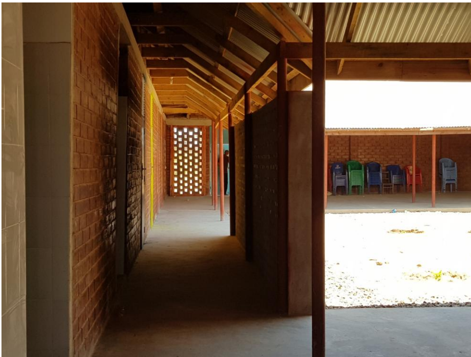
The buildings are planned to be affordable and easy to construct.

Despite the success of the hostel project, challenges remain. Rural Tanzania continues to face high levels of poverty, and the costs of maintaining the hostels can strain local communities. Furthermore, access to secondary education for girls remains limited, with only 26% of rural girls enrolled in lower secondary schools as of 2018. Ukumbi and Lyra in Africa are committed to expanding their work to reach more communities. Plans are underway to construct additional hostels, including one currently in progress in Msanga with the goal of ensuring that more girls have the opportunity to complete their education in a safe and supportive environment.