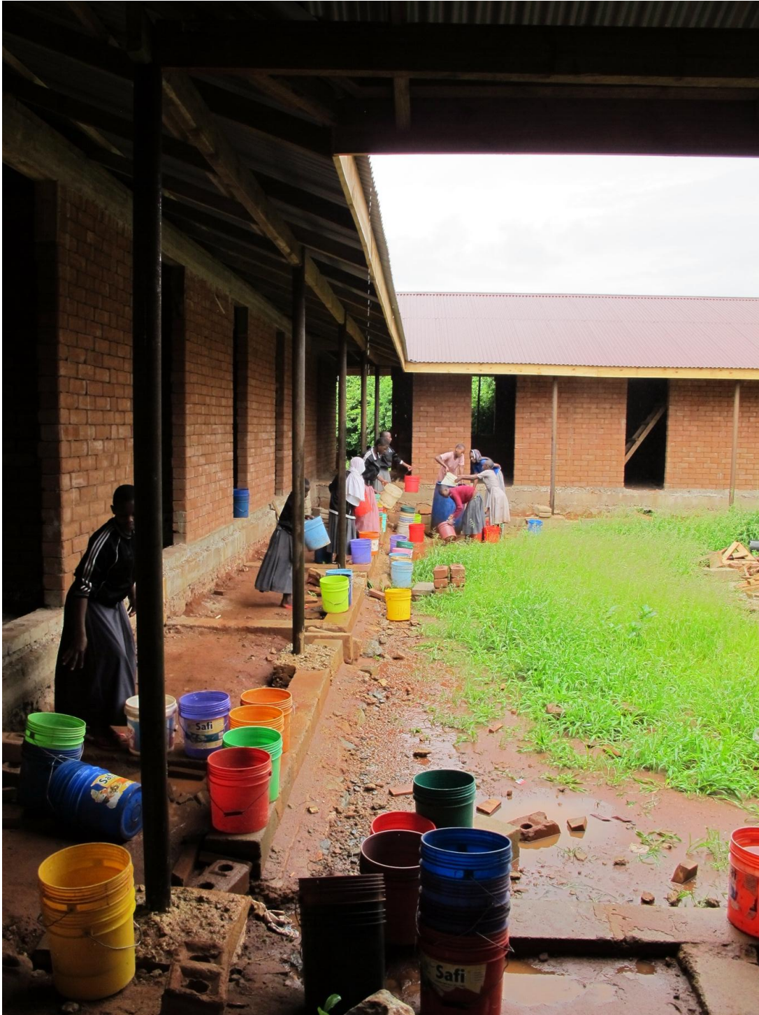
Currently, the sixth hostel of the Ukumbi model is being constructed in the Southern Highlands of Tanzania.