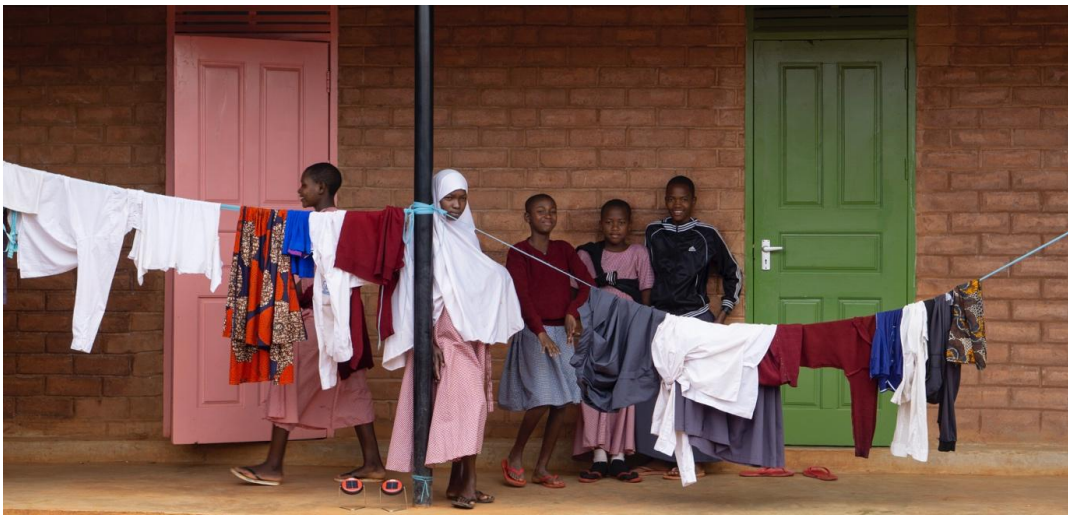
The girls live in the hostels during the week taking care of their laundry.

cement (5-10%) added to stabilise the mixture. The bricks are compressed manually in a block press and air-cured, making them a low-cost, low-carbon alternative to traditional fired bricks or a concrete construction, which are environmentally damaging. ISSB construction reduces both the carbon footprint and the financial costs of building the hostels. The method also aligns with Ukumbi's focus on local engagement, as the manual labour involved allows communities to participate directly in the construction process. Local villagers contribute materials for the foundation and provide labour, fostering a sense of ownership over the hostels and encouraging long-term maintenance and care.