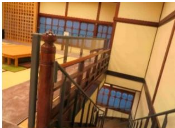
Figure 6a&b. Kenban with elevator annex on the left. Stair guard was added inside.