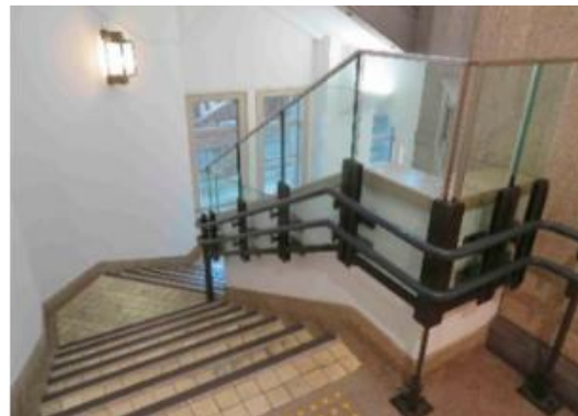
Figure 8a&b. Vertical lift at several places, and guardrail to prevent stair falls.