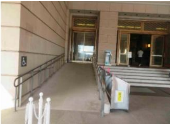
Figure 3a&b. Tokyo National Museum Main Building carriage porch and long ramp to the entrance.