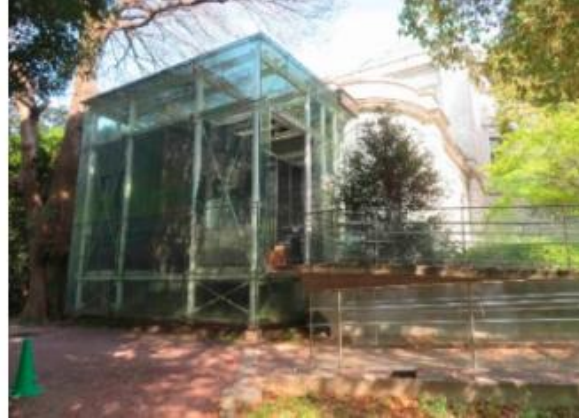
Figure 2a&b. Grand staircase at the front of Hyokeikan and glazed elevator at the back.