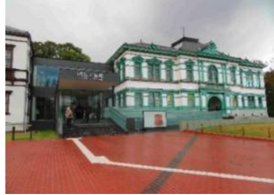
Figure 5a&b. Crafts Gallery, Museum of Modern Art Tokyo and the new National Crafts Museum.

Two buildings owned by the Minato City, Tokyo, seem worth mentioning regarding accessibility provision. The Kenban (Fig. 6), originally built as the assignation office for geisha had been used as accommodation for port workers after the war. Valuing its historical significance as a surviving timber structure, the city obtained the building and renovated it to become a new Center for Traditional Culture. Using the adjoining land lot, a small building was built to house an elevator to be connected to the old timber structure. Designed to be a timber house next door, the annex just looks as if it has been in existence long since.