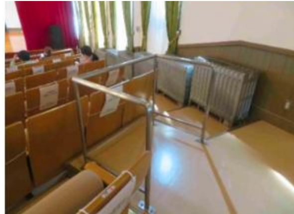
Figure 1a&b. Concert Hall, Tokyo Music School, and the wheelchair space in the hall

Three examples in the list were originally built as residences, and all are now open to public along with the garden. Both the former Iwasaki Residence and former Furukawa Residence are designed by a British architect Josiah Conder, who was one of the invited foreign employees in Meiji era Japan, to teach at the University of Tokyo.