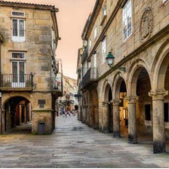
Figure 4: Slope plan at the HCC in Cordoba. Pedestrian street at HCC Santiago Compostela.