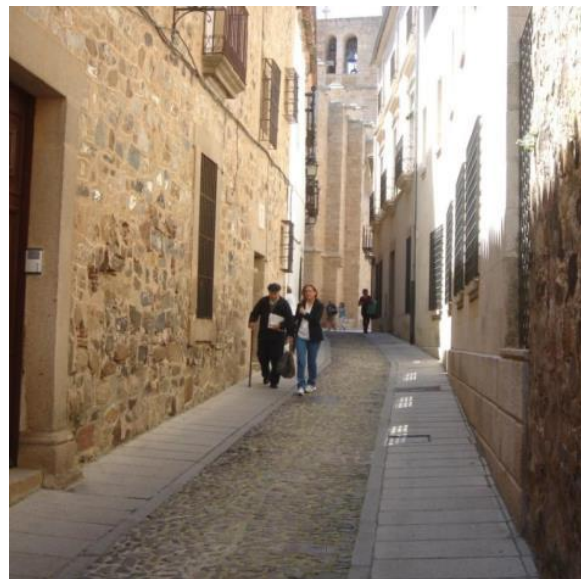
Figure 5: Accessible paving strips in areas of historic paving in Santiago de Compostela and Cáceres.

Regarding the resting points, their major weaknesses lay in the lack of provision of benches (or inadequate ones without a backrest or armrest) or the inexistence of accessible public toilet cabins. This situation often forces some users with less resistance capacity to