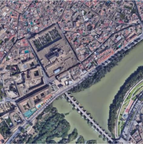
Figure 1: Access Barriers: the medieval wall of Avila and the Guadalquivir River in Cordoba [source: GoogleMaps]

With regard to connections with significant elements of the city, it should be noted that in most cases transport infrastructures (e.g.,