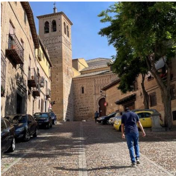
Figure 3: Labyrinthine crossroads in Cáceres. Steeply sloping street in Toledo.