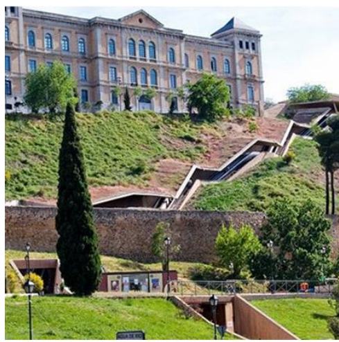
Figure 2: Barriers to connection: the problem of the distance to the train station in Segovia, and the help of escalators in the face of the topography of Toledo.