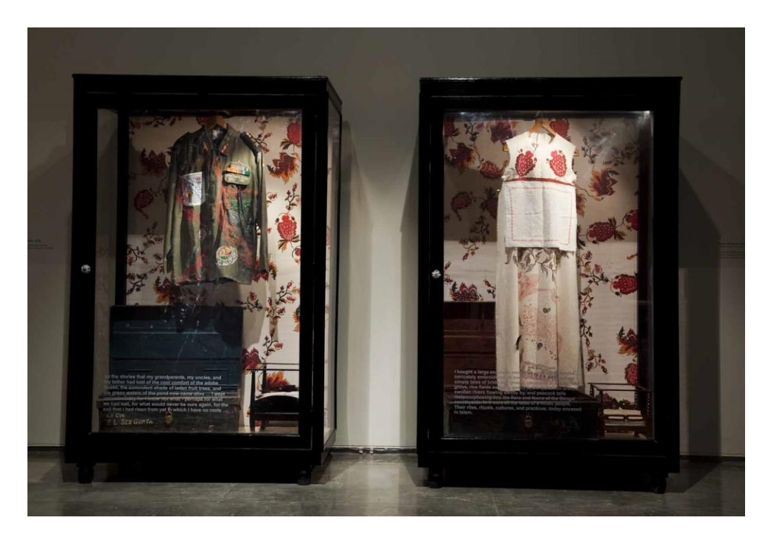
Image 5. Paula Sengupta, 'Rivers of Blood', Wood and fiberglass almirah, found objects, corn paper lining, 2010

Influenced by these artworks, many young emerging artists developed a fashionable practice, almost without any contextual relevance (Image 6, 7).