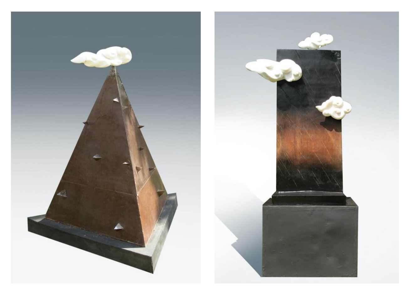
Image 8. Avijit Pal, 'The Cloud', Iron and marble, 2009 (Artist's collection)

without any hesitation. The domain of painting provided me that freedom. (Personal conversation, 10 April, 2019) He could have delved into the trajectory of the fashionable practice of site-specific installations, likewise his contemporaneous sculptors. However, in a conversation with the