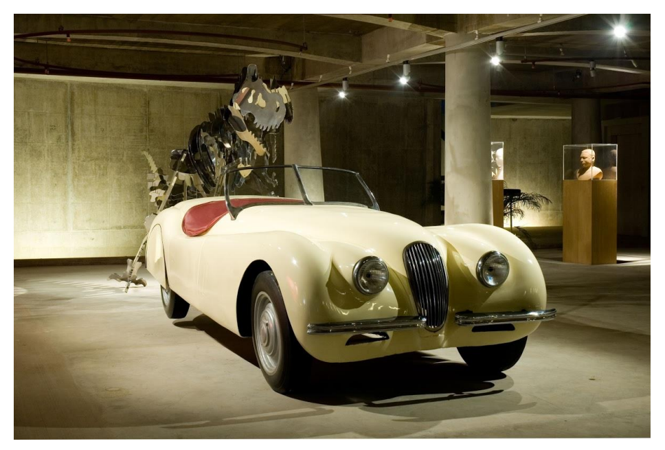
Image 1. Sudharshan Shetty, 'Love', Stainless Steel and Fiberglass, 2006

Since the nineteen nineties, unprecedented technological advancements in electronic media permeated the Indian social arena from the Western world (especially the U.S.) started transforming Indian cultural identities (Khanwalker, 2014). Such development linked itself to innovative broadcast and private reception modes, and gradually the world-view of a new generation of Indian artists was broadened, owing to the sudden encounters with almost all of the on-going events in the international socio-political and cultural domain (Seid, 2007). Installation art, hyperrealism, new media creations, and digital representations swayed the post-Cold War global and Indian platform almost at the same time, laced with the personal "conceptually coded signs" of the artists (Pijnappel, 2007; Kapur,