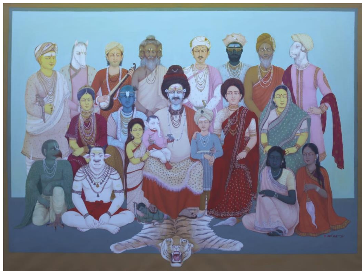
Image 13. Partha Mondal, Group Photo of D-Voter, Tempera on Paper, 2009 (Artist's collection)

'Group Photo of D-Voter' (2009), which portrays a group of Hindu deities (Image 13). Most of them are clad in clothes that we encounter people wearing in a typical Hindu marriage these days. All of them are standing or sitting still in front of the viewer as if they have given pose for a group or family photo in front of a camera. In Mondal's own words,