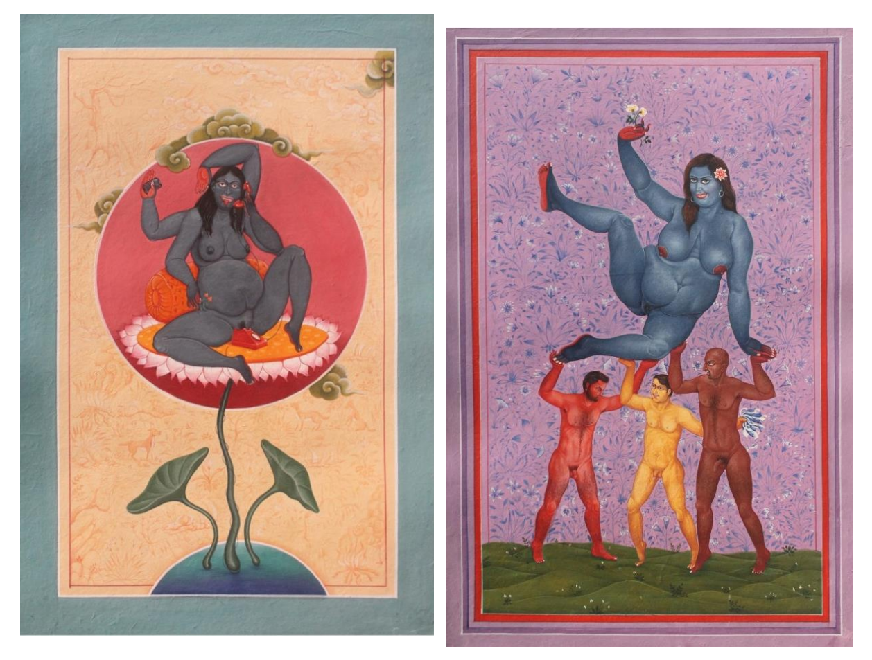
Image 10. Avijit Pal, 'Dirty Conversation', Tempera on Nepali Handmade paper pasted on Board, 2017 (Artist's collection)

Since I'm portraying a domain govern by a Queen, I thought it would be better if I choose the medium of opaque watercolour – as it was used in medieval India. In the