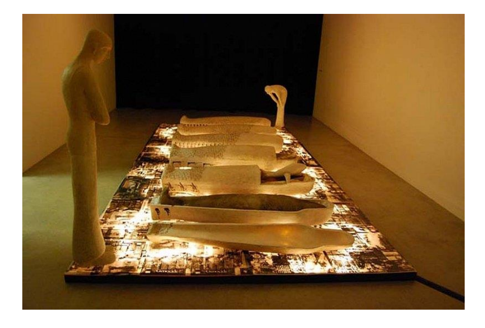
Image 3. Chhatrapati Dutta, 'Monocular-Binocular', Wood, found objects, textiles, iron, glass, serigraphy, video, light & sound, 2008