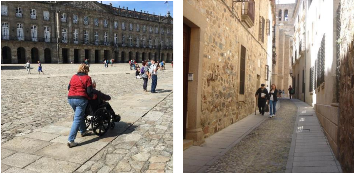
Figure 5: Accessible paving strips in areas of historic paving in Santiago de Compostela and Cáceres.

On the pavements, the existence of cobblestones or stone slabs with large joints between pieces that generate discontinuities and balance difficulties is widespread. This is also a problem for wheelchairs and pushchairs [12]. In view of this situation, it is worth highlighting the provision of strips with suitable smooth paving in Cáceres or Santiago de Compostela (Figure 5). Regarding the installation of TWSI strips, there are significant difficulties with the issue of colour contrast, which sometimes conflicts with the heritage character of the space (in Avila, the use of red on HCC pavements was prohibited) and the lack of continuity in the tactile routing strips (something common not only in HCCs).