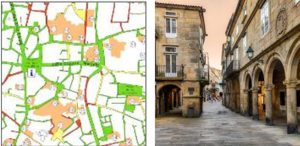
Figure 4: Slope plan at the HCC in Cordoba. Pedestrian street at HCC Santiago Compostela.