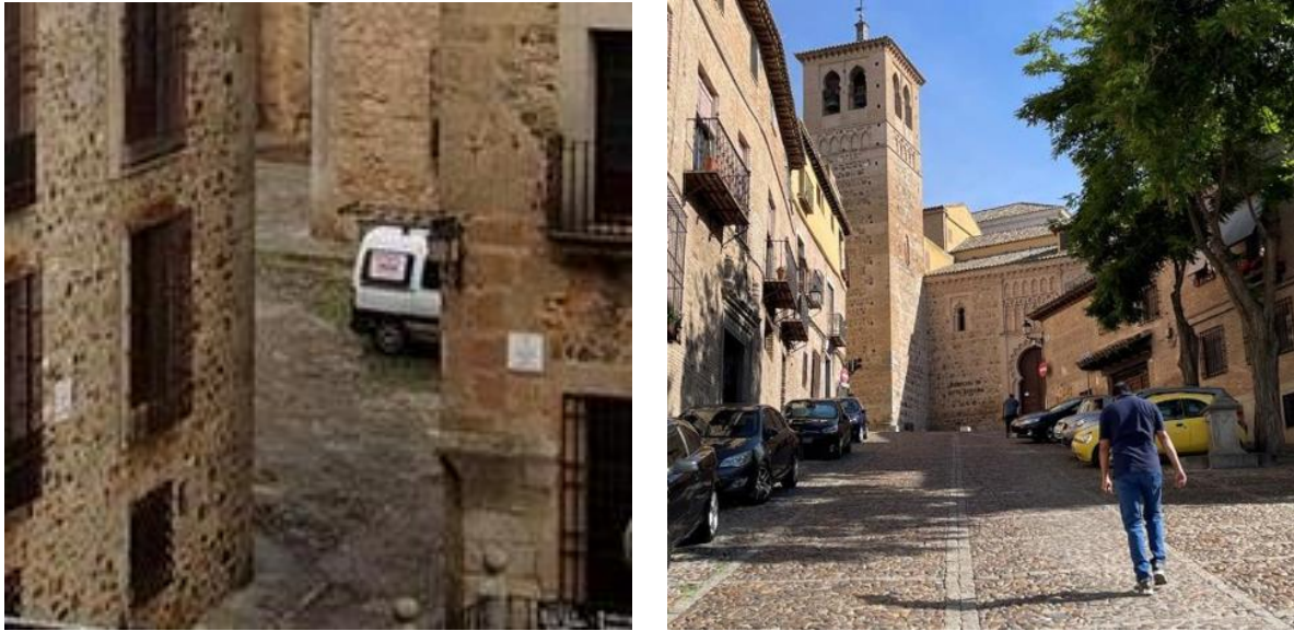
Figure 3: Labyrinthine crossroads in Cáceres. Steeply sloping street in Toledo.