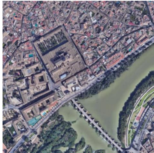
Figure 1: Access Barriers: the medieval wall of Avila and the Guadalquivir River in Cordoba

With regard to connections with significant elements of the city, it should be noted that in most cases transport infrastructures (e.g.,