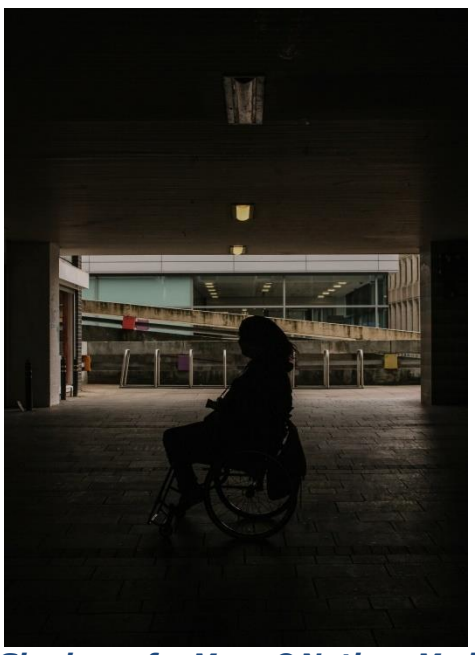
04_Shadow of a Man_©Nathan Mcdine

Just as today there are in all architecture schools subjects focused exclusively on sustainable development strategies, it will be necessary to incorporate in regular courses subjects that consider as part of the training, the basic concepts to create inclusive spaces and that in everyday life turn out to be strange for professionals who are not specialized in the subject.