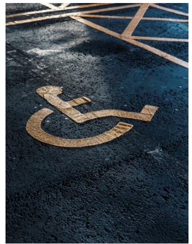
06_Accessible Parking Spot_©Jakub Pabis

Understand that designing for all, under a vision of universal design, not only benefits people who live with a disability, but also that its approach also encompasses the elderly, pregnant women, people of short stature, and, in many cases, individuals who have suffered a temporary injury as could happen to any of us.