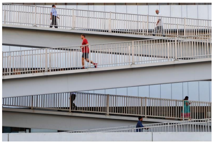
05_Unnamed_©Franzie Allen Miranda

On many occasions, the vision around accessibility is limited to thinking of a single type of disability, whose solutions are restricted to the use of ramps for horizontal circulation and contemplate elevators to solve vertical mobility. But based on this approach, the fact that there are different types of disability, which require much more complex and multidimensional approaches, is being completely ignored.