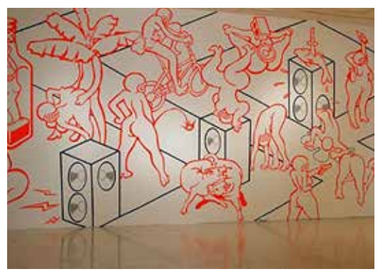
Ex. 6 (Leasho Johnson, Back a Road – The Session, 2013)