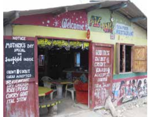
Ex. 3