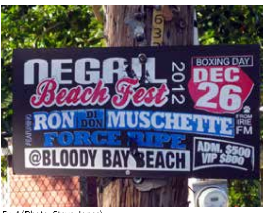
Ex. 4